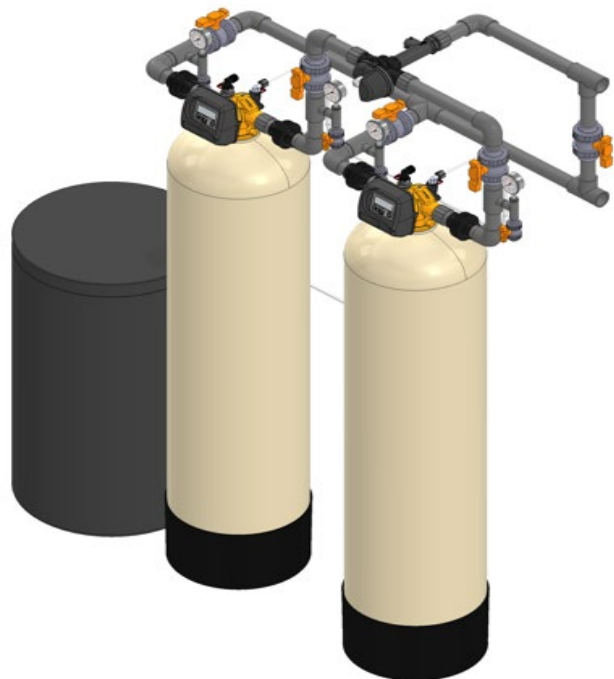
* Pipe and fittings shown not in scope